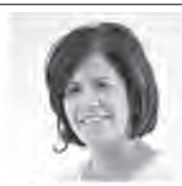
BERKSHIRE HATHAWAY HomeServices Fox & Roach, REALTORS®

www.OrenderFamilyHome.com • 2643 Old Bridge Road, Manasquan