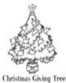
Christmas Giving Tree

ST. DENIS GIVING TREE – It is that time of the year again when we will engage in the spirit of giving. Beginning next weekend our Giving Tree will be displayed in the Gathering Space of the church. If you wish and are able to do so, please take an ornament and purchase the suggested gift. The offering is then