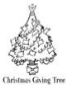
Christmas Giving Tree

ST. DENIS GIVING TREE – It is that time of the year again when we will engage in the spirit of giving. Our Giving Tree is now displayed in the Gathering Space of the church. If you wish and are able to do so, please take an ornament and purchase the suggested gift. The offering is then to be returned with the ornament taped onto it.