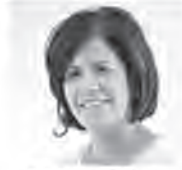
BERKSHIRE HATHAWAY HomeServices Fox & Roach, REALTORS®

www.OrenderFamilyHome.com • 2643 Old Bridge Road, Manasquan